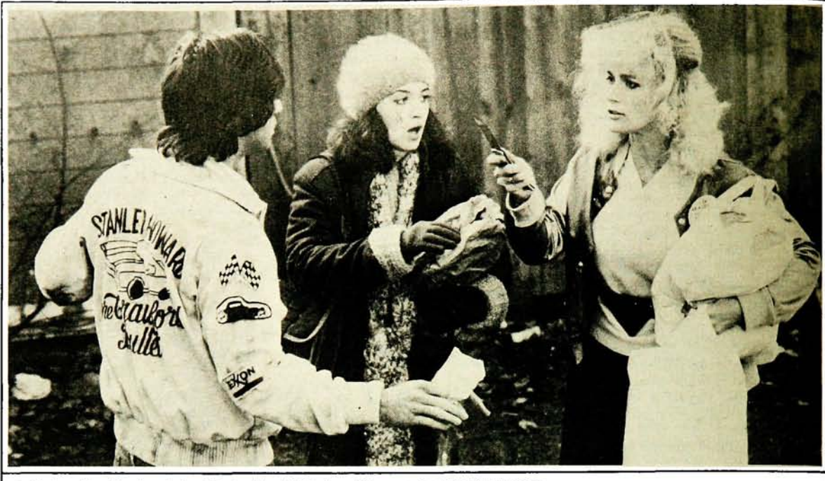
Staving off another heartache, Rita stands up to Stanley while a surprised Bonnie watches

Rita, like Pete, is a dreamer whereas Bonnie, like Joey, is much more of a realist. Both people complement each other and their symbiotic relationships act as a kind of barrier against the vicissitudes of life. Rita sets her sights high. She shares this characteristic with Pete, who is continually attracted to women from another social class, who have bourgeois tastes, and they some-