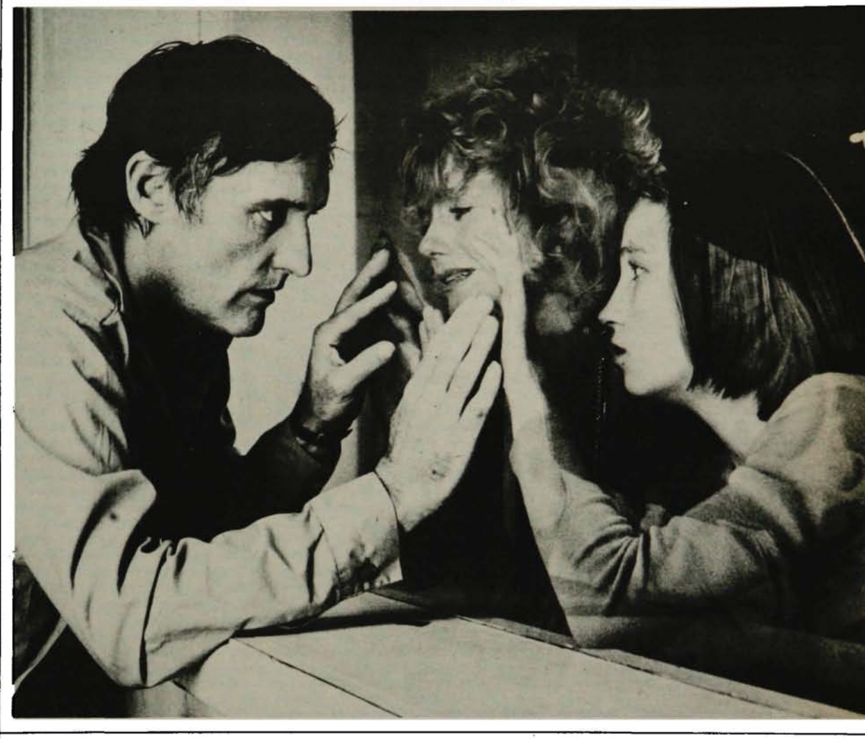
A prison visit in Out of the Blue

The film appears to have undergone some heavy recutting; the rhythms get awfully jagged towards the end, and a climactic scene that suggests some past incestuous encounter between father and daughter is close to incomprehensible. None of that, however, explains what's principally wrong with Out of the Blue. There is a cockeyed aspiration