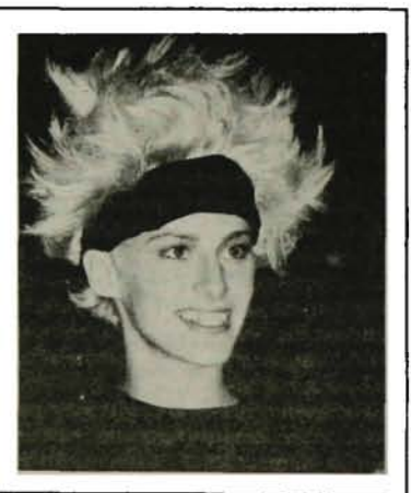
Punk was prominent as Liquid Sky screened in Montreal