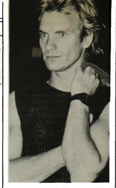
From leader of the band to Brimstone Stine

From a 'press' point of view, people at Montreal were more accessible but things were less efficient. I was really startled when I arrived in Montreal to discover that if I wanted to do an inter-