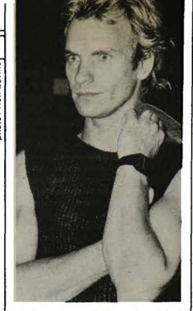
From leader of the band to Brimstone Stine

From a 'press' point of view, people at Montreal were more accessible but things were less efficient. I was really startled when I arrived in Montreal to discover that if I wanted to do an inter-