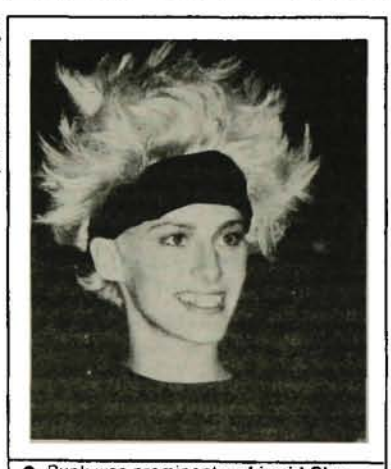
Punk was prominent as Liquid Sky screened in Montreal