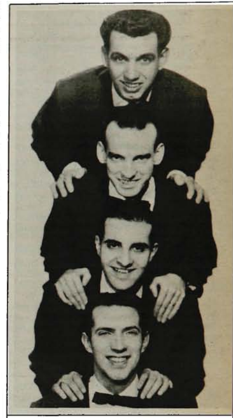
The Crewcuts in 1954: faded memories

Pop can include dixieland, big bands, jazz, blues, folk, country, middle-of-the-road (MOR), rock, reggae and anything else that's ever received AM airplay and Canada has produced important and interesting artists in virtually all those fields. But Heart Of Gold doesn't try to be complete. Partly from considerations