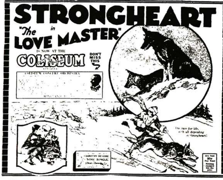
· If it's snowing it must be Canada, as the fine-print reveals

From a press release : Cyril Symes, culture critic for the New Democratic Party, 1979