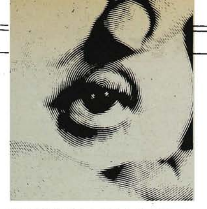
TECHNOLOGY & VIDEO