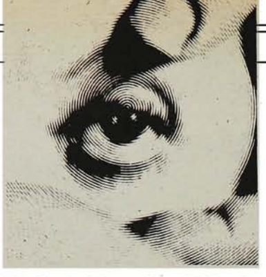
TECHNOLOGY & VIDEO

Our new broadcasting strategy for Canada addresses this fundamental question. And it provides an answer which recognizes the virtual impossibility for any nation of building walls high enough to keep out signals emanating from outer space. Indeed, we want Canadians to have access to the best the world has to offer. Yet we are also deter-