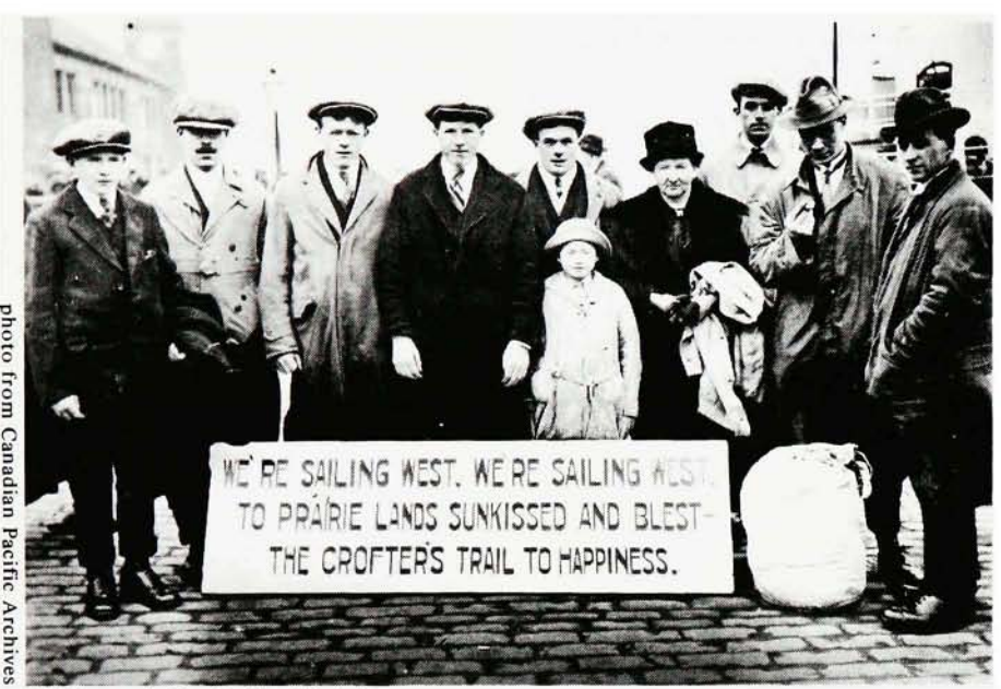
High hopes in Our Cultural Fabric

ed when so attired in Canada, while the filmmakers reveal through the juxtaposition of magazine stills and live models the way in which high-fashion has co-opted "peasant" styles of dress. As well, the filmmakers interviewed a professor of anthropology who is able to explain the symbolic and practical rationales behind a wide variety of dresscodes. There are moments of subtle humour, irony and even bitterness which emerge throughout Our Cultural Fabric, as well as the few fascinating explanations of cultural customs like those mentioned earlier. But such moments are kept short, oddly enough. Instead, the filmmakers have structured their film around a bizarre intrusion which, for me, reveals their own unacknowledged perceptual bias.