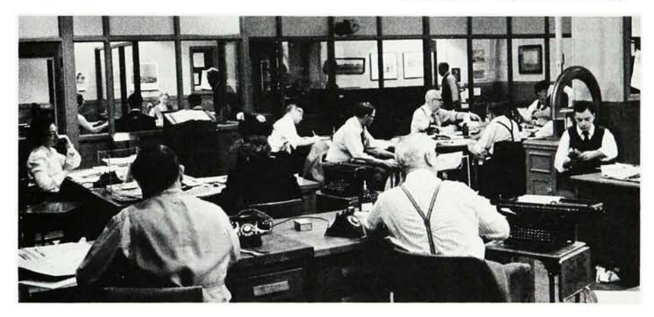
Scene from "Why Rock The Boat?"