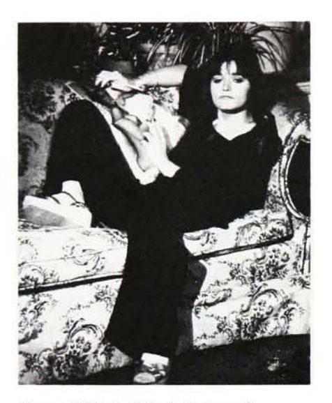
Margot Kidder in "Black Christmas"

The strangest thing about seeing this anti-female stock horror caper at the Imperial in Toronto was the incredible juxtapositioning of it with a reasonably clever, highly female-oriented 1972 NFB short, L'oeuf by Clorinda Warny, full of surreal effects and montages relating to eggs and life. Someone must