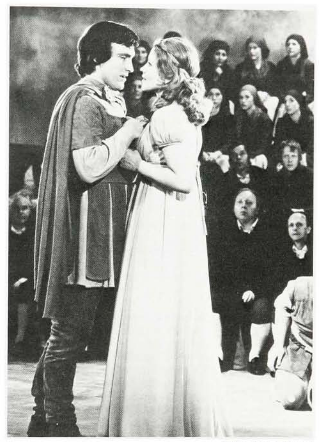
"The Magic Flute"

The Magic Flute. Ingmar Bergman finally brings Mozart's comic opera to the screen —the T.V. screen, that is, though it is also destined for the cinema (in Scenes from a Marriage fashion). A huge success in Scandinavia and in Cannes, this playful filming is really a prodigious performance by Bergman-the-magician, a transformation of opera into television as has never been done before. Never has Bergman shown more playfulness, joy, sheer fun —and once again he proves himself the master of all dramatic arts. Bergman, by the way, is now preparing another six-part television series starring once again Liv Ullmann and Erland Josephsson. This one, however, (titled Face to Face) promises to be to-tally different to Scenes.