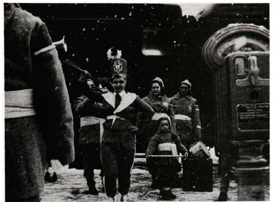
A twirling majorette during a winter celebration Brault and Groulx's Les Raquetteurs"

McLaren's films" and "all of Pierre Perrault's films."