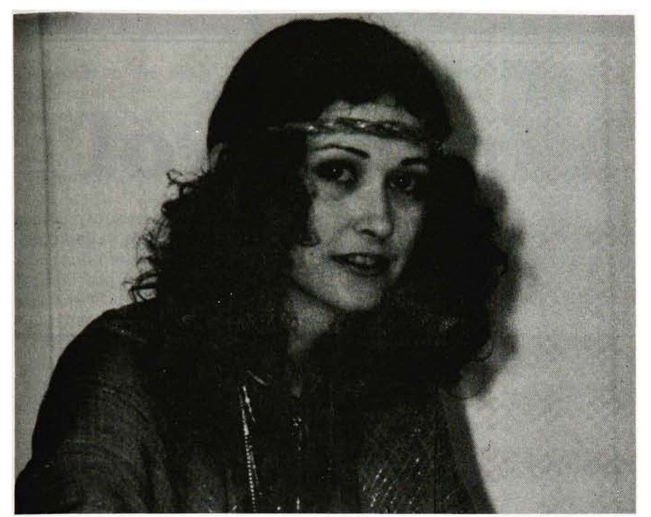
"And when her professional accomplishments don't get her into the news, her outspoken comments, cool good looks and outrageous dress do."

twenty years, I've been sort of undercover studying. I knew that I couldn't cash in on a film career with any personal satis-