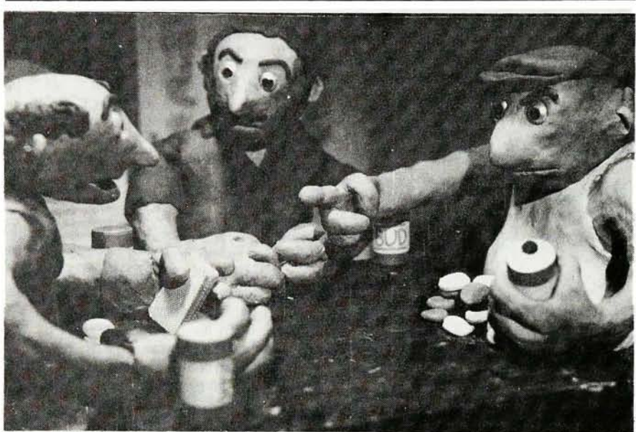
Fine and Mann's larger-than-life characters playing poker in The Only Game In Town —certainly the only one with Plasticine puppets

works cannot be acquired from an hourlong film. But A Path of his Own serves as a valuable introduction — perhaps the most a cinematic study of art can hope to do. Gerry Flahive