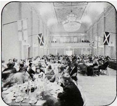
Main Dining Room, THE SAINT LAWRENCE HALL, Saturday November 17th, 1973.