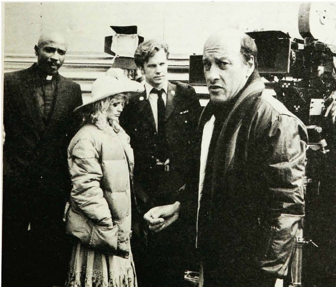
On 'Finders Keepers' starring Lou Gossett Jr, Beverley D'Angelo and Michael O'Keefe; Director Richard Lester answered the question