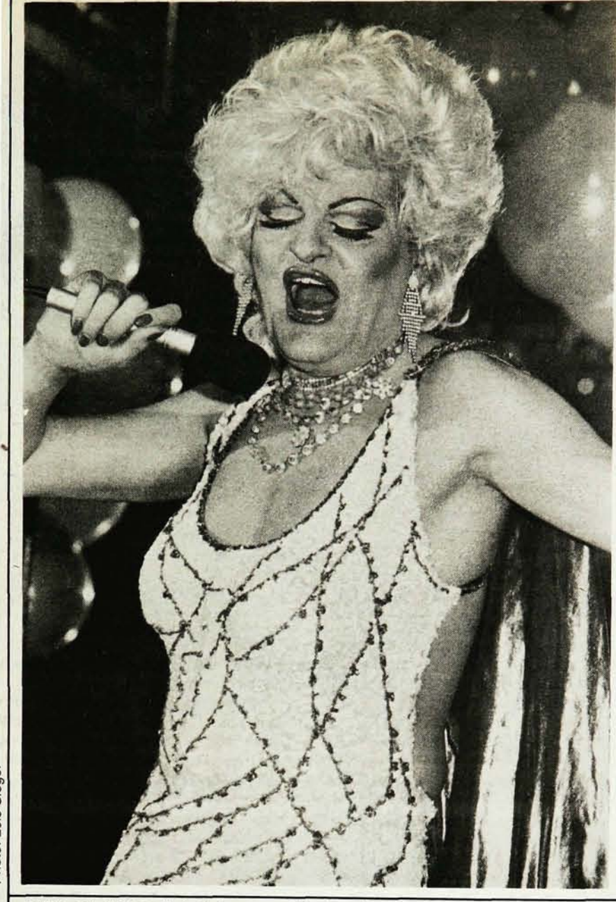
• "I've got what you desire", sings one of Lip Gloss's transvestites

At The Bellevue, middle-aged men mingle with punks who mingle with people wearing polo shirts. Beer is $1.75. A young man with blond hair and faded jeans tells the waiter, "Maudit, it's expensive. I can get it cheaper in Quebec." The busy waiter, hair tied into a ponytail, eyes framed by red glasses, and with a miniature sword dangling from one ear, remains unfazed. "Well, why don't you go there and get one," he