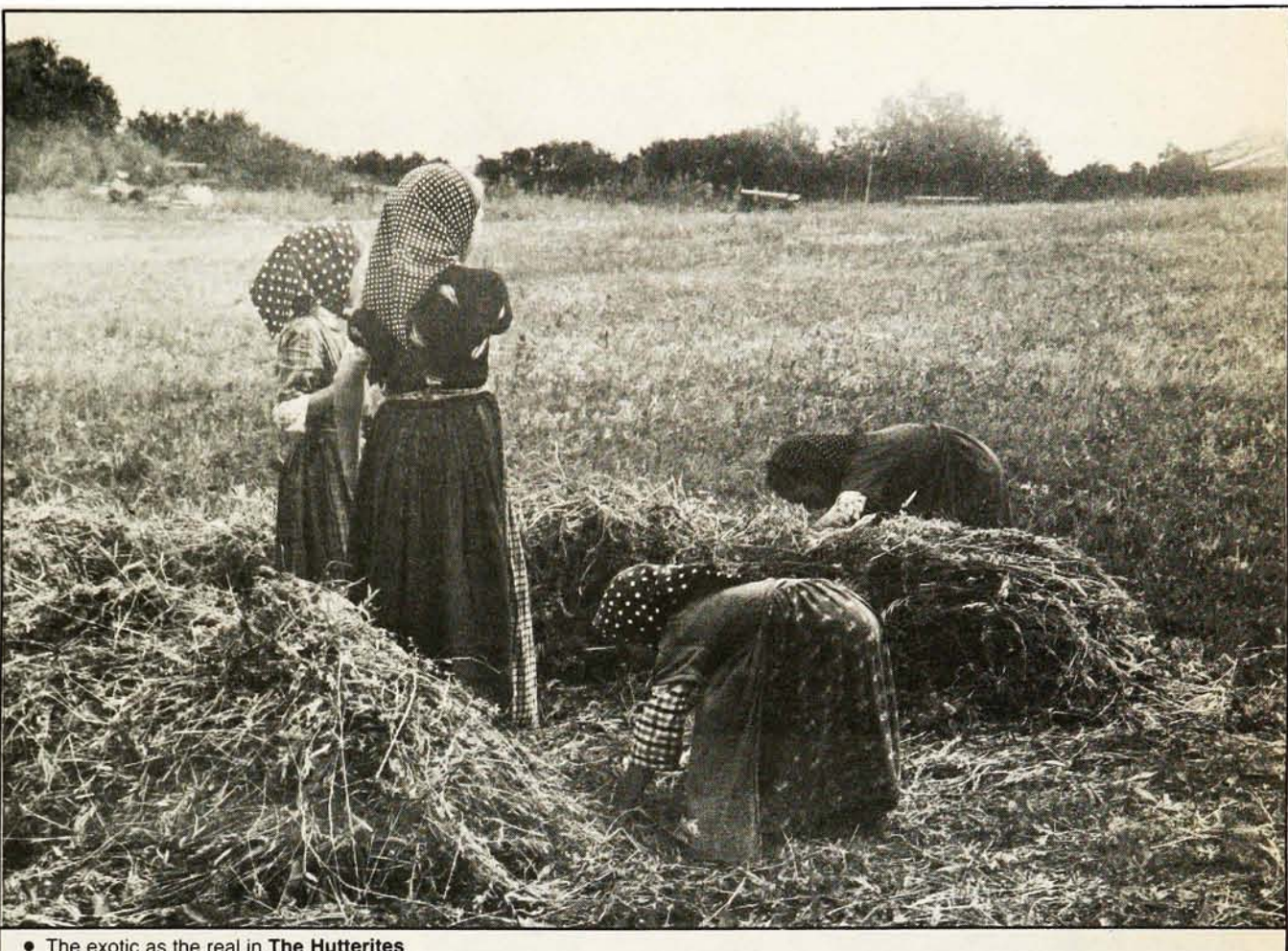
The exotic as the real in The Hutterites