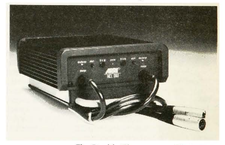
The Double Charger