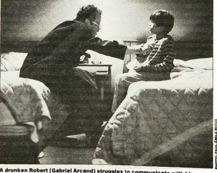
A drunken Robert (Gabriel Arcand) struggles to communicate with his son Maxim (Simon Gonzalez) in La Ligne de chaleur

Instead of rejecting totalizing forces, The Body and the World swoons elaborately in a wished-for but never realized unity with a whole host of others, among them women, tropical cultures and the landscape. And the film's strategies – epic length, extensive quotation, avant-garde formal practices, "essential" concerns (being, knowing, loving, losing, etc.) – allow it to take on the guise of universality, certainly of Significance. The film presents such exhaustive "evidence" and cloaks itself so completely in the garb of Western intellectual avant-gardes that it forgoes its status as the product of a single