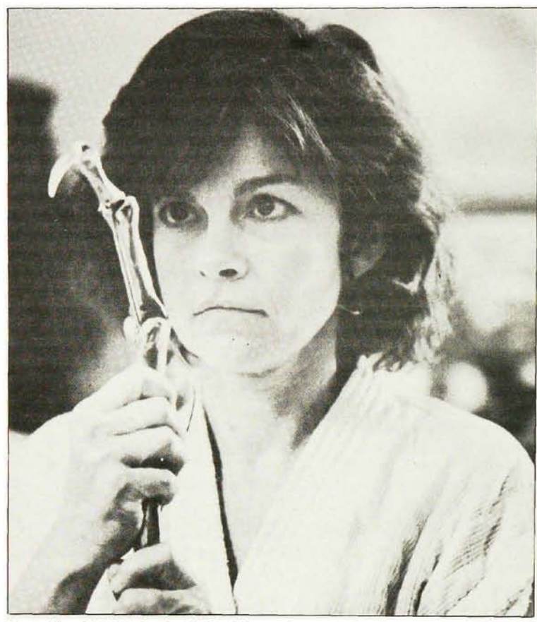
Geneviève Bujold, playing Claire Niveau, in Dead Ringers

We wait for the instruments and they're worth it – strange and beautiful, brutal and loathesome. Beverly, ritually garbed in blood red, brings them into the unnaturally dark operating theatre. He's going to use them. Their unveiling and the subsequent build-up make a classic suspense sequence, but the moment Beverly strikes, everything dissolves into unintentional comedy as he flings himself atop the patient to grab her anaesthetic mask and babble, "I need