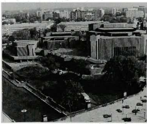
The exterior of the National Arts Centre, Ottawa

It is expected that animators from all over the world will enter and attend this festival, and that it will provide an excellent opportunity for Canadian filmmakers working in this area to meet and confer with their