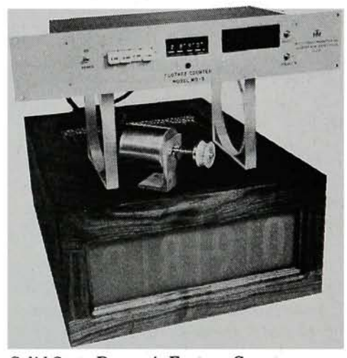
Solid State Dynamic Footage Counter

MultiTrack Magnetics Inc. has designed a footage counter unique in the film and television industry. The MD-3 Dynamic Counter has four counting or dividing circuits that allow the user to cross-reference running times in 35 mm., 16 mm., Super-8 and time. This is a big advantage in 16 mm. for later blow-up to 35 mm. or reduction to Super-8. Editing for television use is now particularly easy with the almost instant comparison between footage and time. Additional comparator