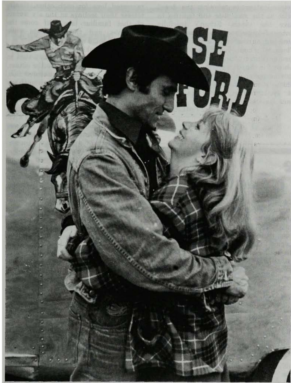
The joyful flow of healing in Goldenrod

deem all the years gone by is a dream of the highest art – like Lear and The Winter's Tale and Dombey and Son – and of the quite low, like Harvey Hart's production of Goldenrod.