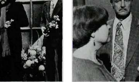
R. Bruce Elder

The Winners: The Canadian Film Awards 1976