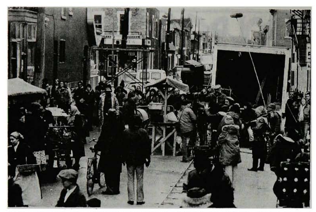
"A movie on your very own street is a dream come true." On location with The Lucky Star crew

intently, all alone. Further along, the set. The table is set for three. Jars of jam, a salami, and some very white bread.