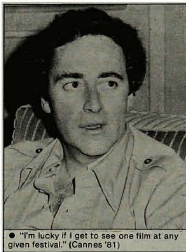
● "I'm lucky if I get to see one film at any given festival." (Cannes '81)

Cinema Canada: Given your global perspective of Canadian film in relation to foreign film, how do we compare?