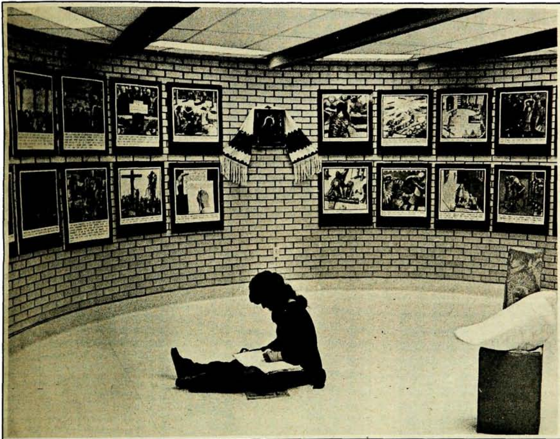
● Kurelek's "Passion of Christ" on exhibit in Niagara Falls