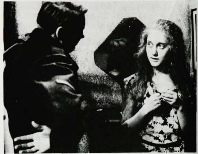
McGrath with Carol Kane