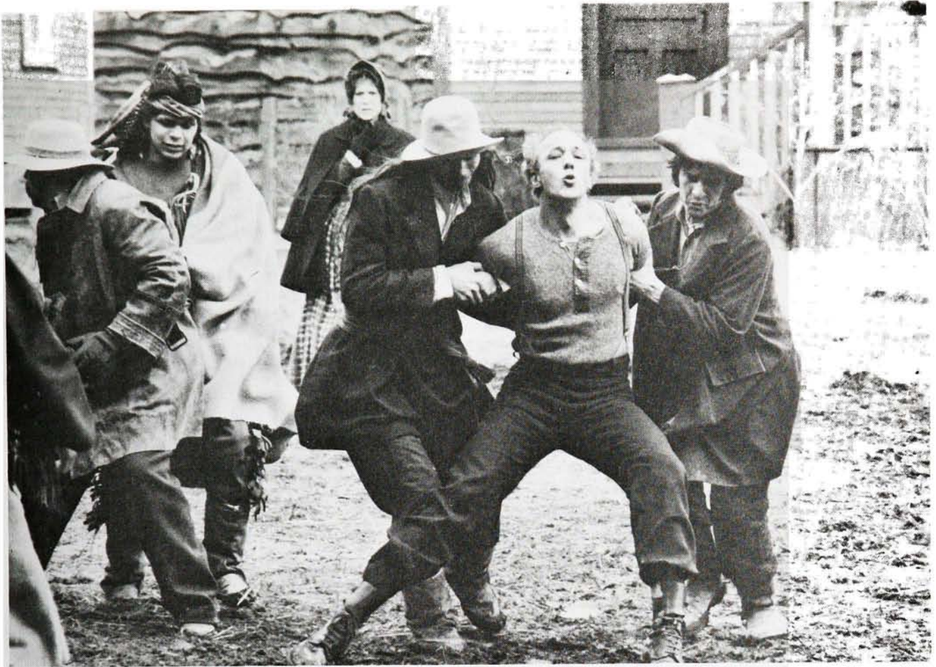
The Métis, led by Dumont, come to threaten the Schultz homestead