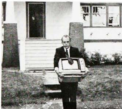
the skip tracer collecting

Most of the film suffers from obvious artifice. The major flaw is the uniformly poor acting. I assume everyone in-