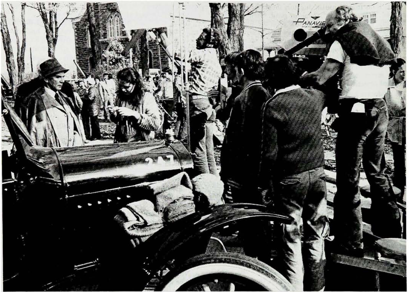
Last minute touch-up before the camera rolls

on descriptions of gestures, postures, movements and illuminating passages on light to convey unsummarized feelings. In film, as Bazin has noted, we must proceed on the behaviourist proposition that outer actions reveal inner emotions. But in these days of Berne et al, complete inventories of gestures are publicized for use in hiding true states of mind. This would tend to invalidate the direct transfer of gestures from book to film.