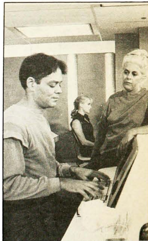
● Commanding the powers of Adam