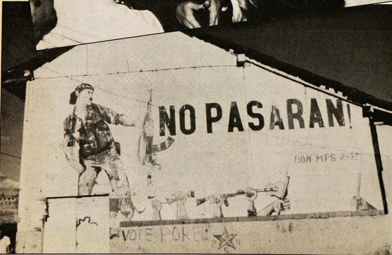
• The walls of Matagalpa echo the Spanish Civil War's tragic cry, "They shall not pass"