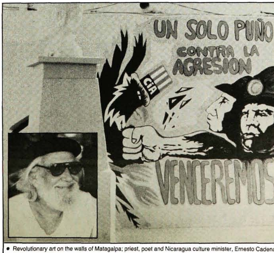
• Revolutionary art on the walls of Matagalpa; priest, poet and Nicaragua culture minister, Ernesto Cadenal