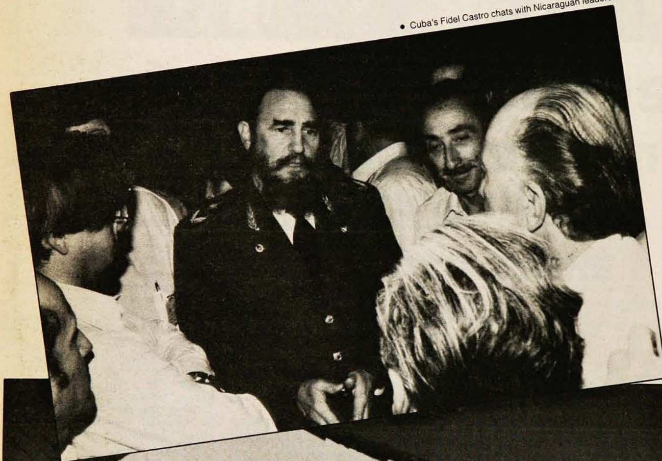
• Cuba's Fidel Castro chats with Nicaraguan leaders

Later, a puppeteer pointed out that, "For 25 years, the CIA has been trying to kill this guy and you could have blown him away just like that." Well, lucky for Fidel, we hadn't come on behalf of the CIA and there were only Sonys in those camera bags.