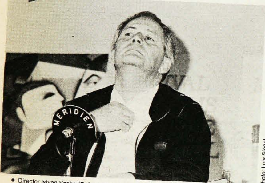
• Director Istvan Szabo ( Colonel Redl )