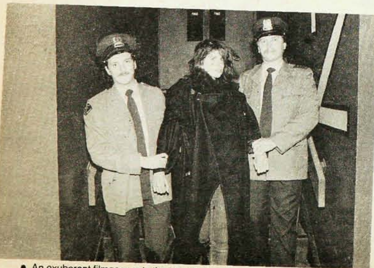
• An exuberant filmgoer gets the heave-ho