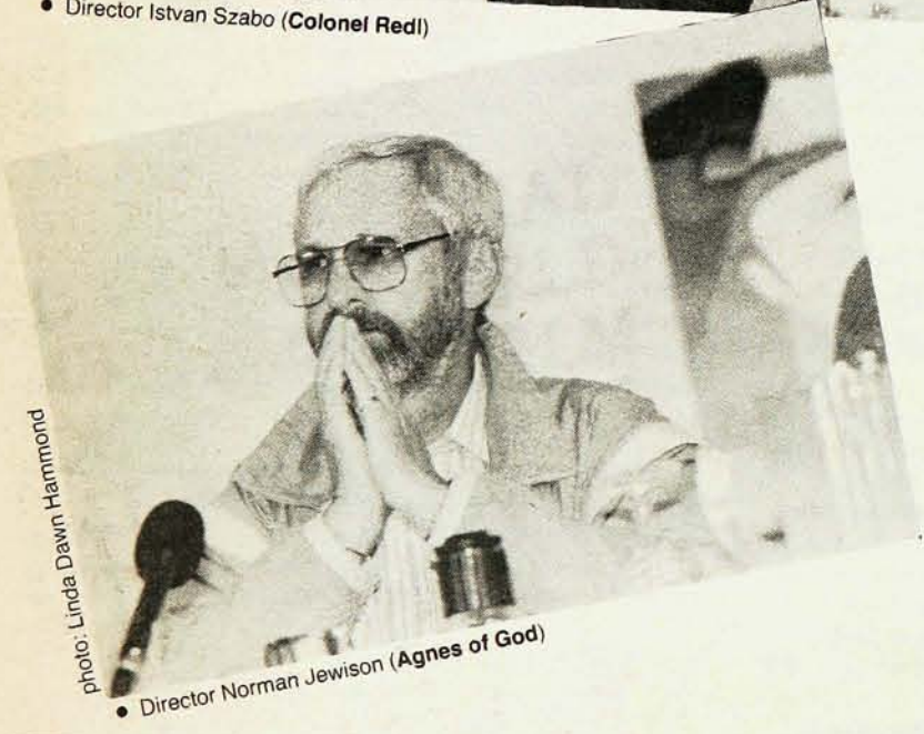
• Director Norman Jewison ( Agnes of God )