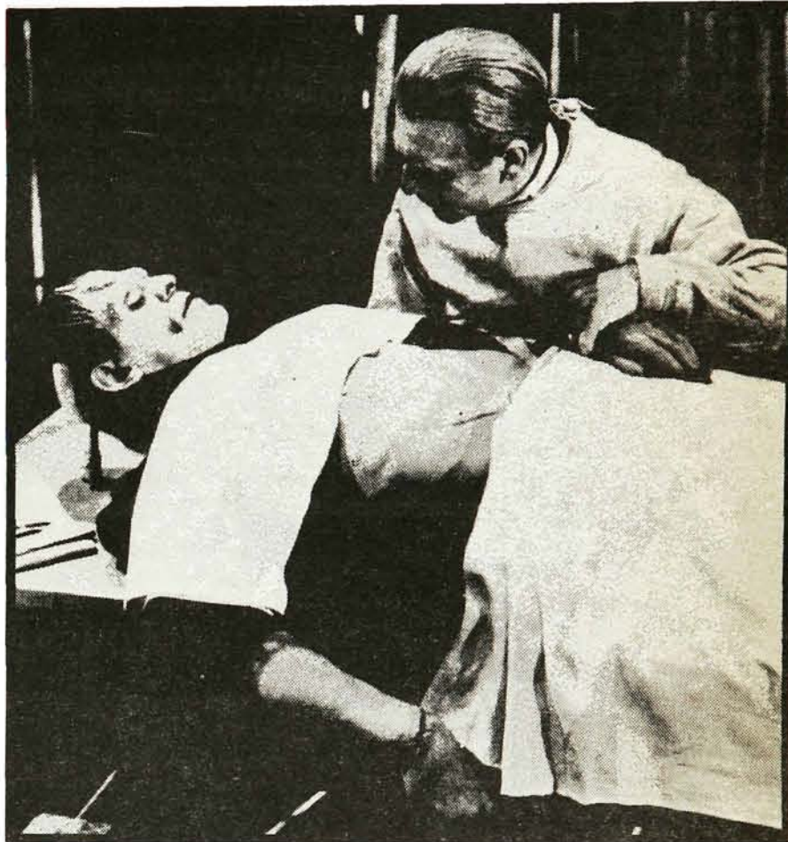
photo: James Whale, Frankenstein, U.S.A., 1931

Like maniac surgeons, it's now the turn of you politicians to lean over the body of that unfortunate creature, public service television.