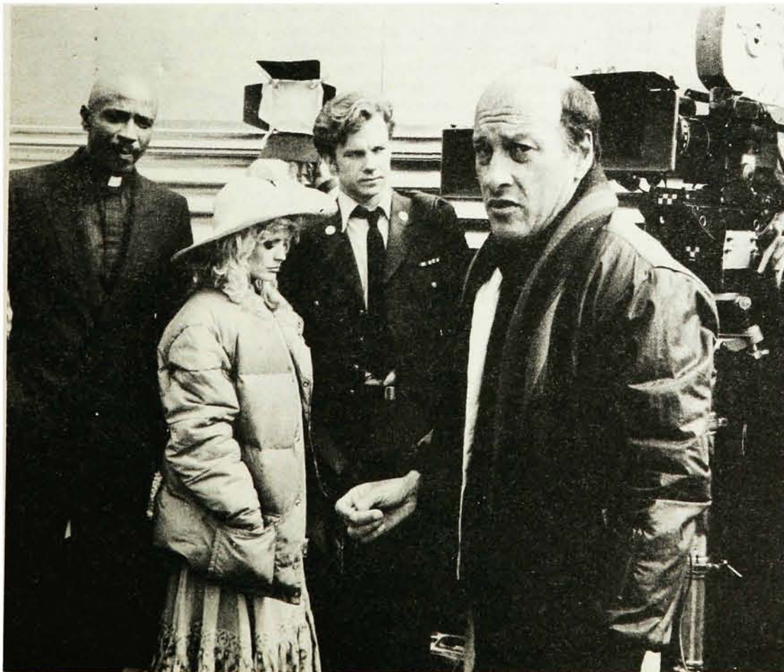
On 'Finders Keepers' starring Lou Gossett Jr, Beverley D'Angelo and Michael O'Keefe; Director Richard Lester answered the question