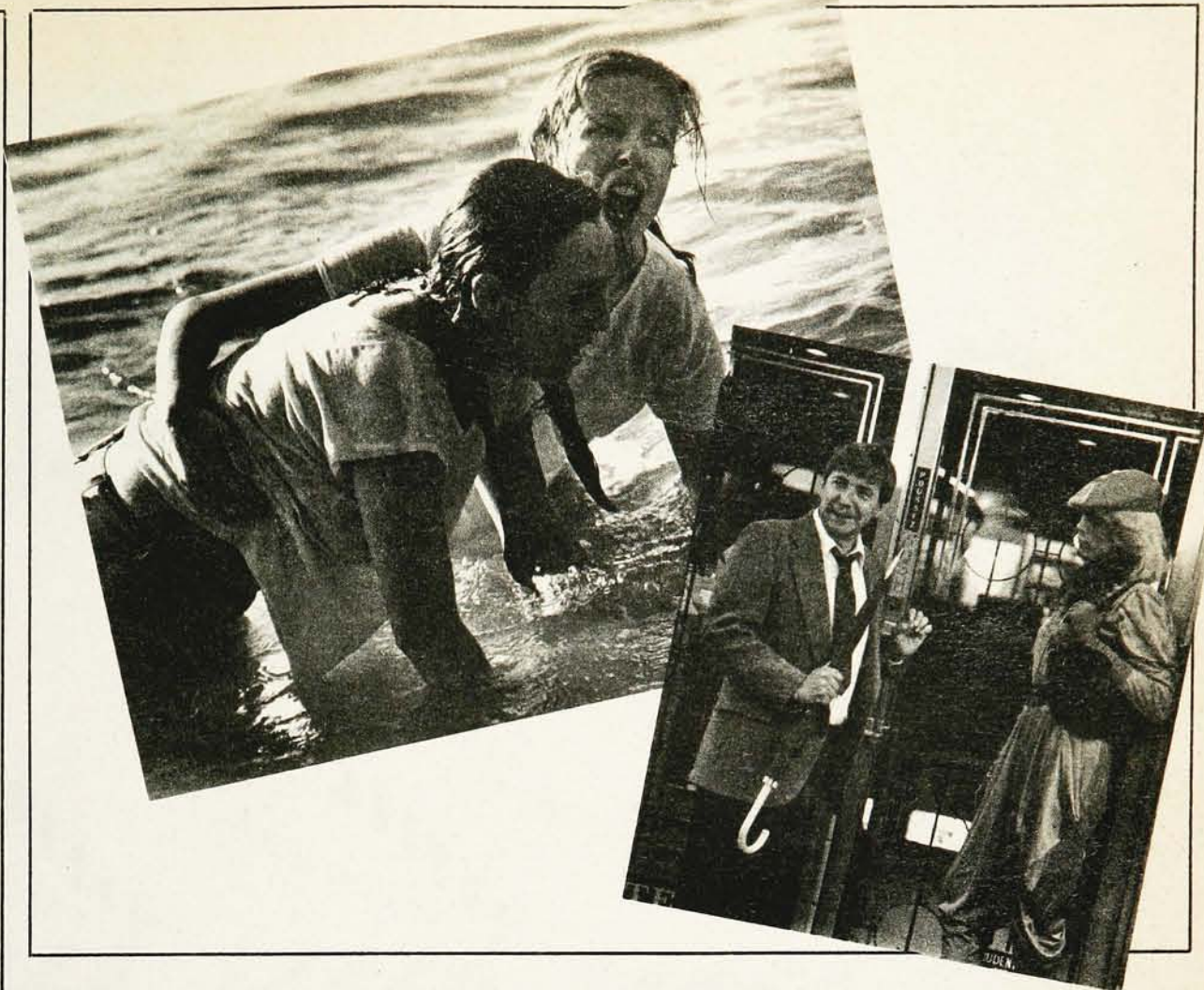
●With award-winning films such as Denys Arcand's Le Déclin de l'empire américain (above Rémy Girard and the 'sexist' transvestite) and Anne Wheeler's Loyalties (starring Tantou Cardinal and Susan Wooldridge), Canadian cinema is experiencing a renaissance. In this festival issue, Cinema Canada celebrates the achievements of the Canadian filmmaker.

Administrative and editorial: 834 Bloomfield Ave., Montreal (Quebec) H2V 3S6 Telephone: (514) 272-5354 Toronto: 67A Portland Street, Toronto (Ontario) M5V 2M9 Telephone: (416) 596-6829 Mailing Address: P.O. Box 398, Outremont Station, Montreal (Quebec) H2V 4N3.