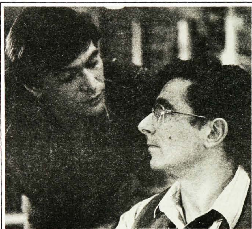
• Half A Lifetime : Nick Mancuso as Toby, Saul Rubinek as Sam