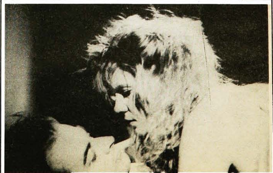
• A scene of 'alienation' from Sandor