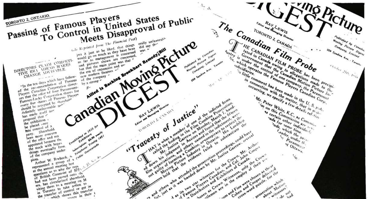
Headlines during the Combines Trial

A trial followed the report in the Ontario Supreme Court with 109 defendants – all individuals or companies