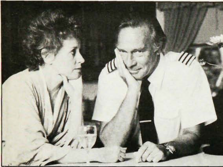
Roberta Maxwell and Christopher Plummer in Kingsgate