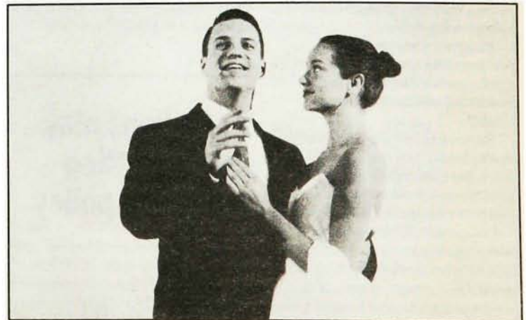
The Mario Lanza Story