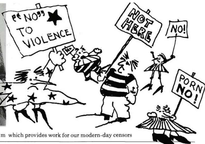
Interviewing in a film entitled Pussy Talk : this is the sort of film which provides work for our modern-day censors

31, 1975, only eight films (out of 930 submissions) were not approved for exhibition. (Two of these were 16 mm prints.) Of the 824 feature films (35 mm) submitted, 165 were classified as "general exhibition"; 321 as "Adult Entertainment"; and 332 as "Restricted." In all there were 134 requests for eliminations.