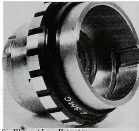
Six Element Lens Extender

optimum resolution and multi-coating reduces flare, reflections and ghost images while improving contrast and color saturation. The extender is available in mounts for the Arriflex Standard, Eclair CM and Arriflex bayonet which can be used with any Arri bayonet-mounted zoom lens and certain focusable prime lenses. Additional information available from A.G.E. Inc., 1430 N. Cahengua Blvd., Hollywood, Calif. 90028.