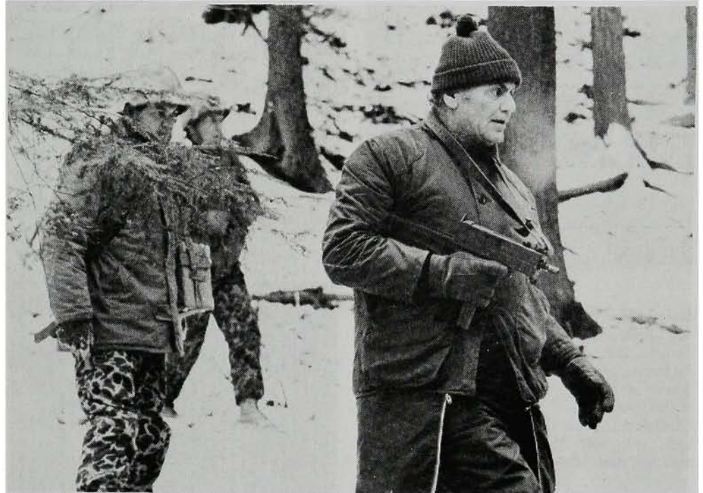
Ernest Borgnine tracks down his man in Shoot