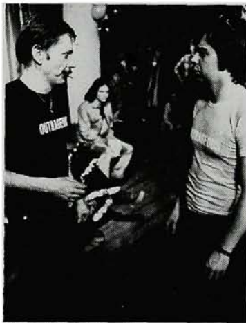
Production shot from Outrageous