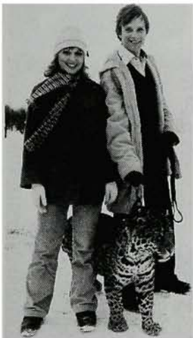
Leopard in the Snow