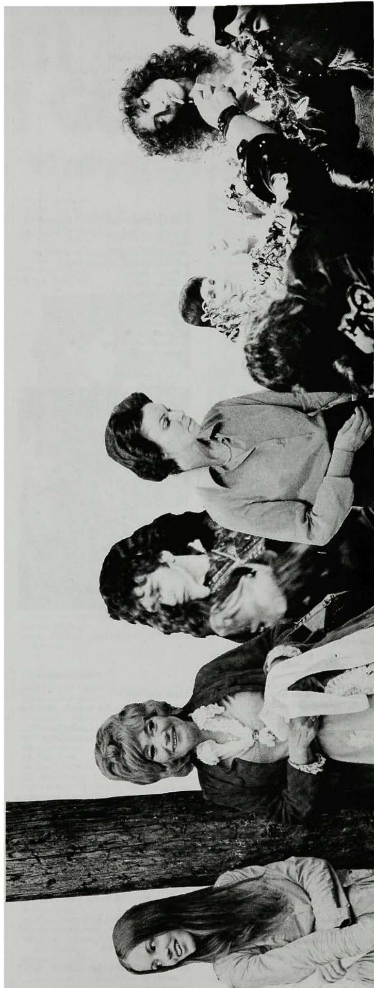
Familiar faces from Eliza's Horoscope , A Sweeter Song , L'absence and Le soleil se leve en retard

Abbreviations: Can (Canada), Fre (France), GB (Great Britain), Nor (Norway), US (United States).