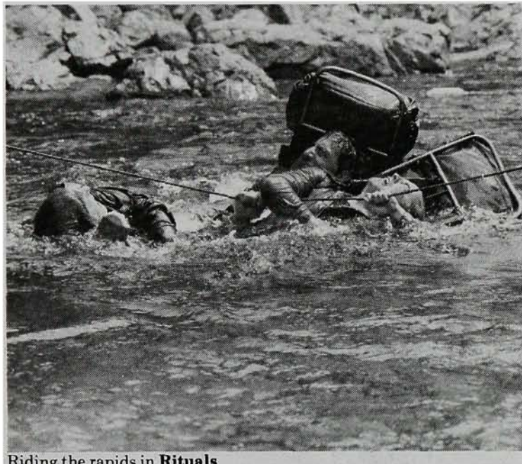
Riding the rapids in Rituals

Another story: the flawed Olympics film, a movie that could not miss, but did; but which still will do well, inevitably, in international sales.