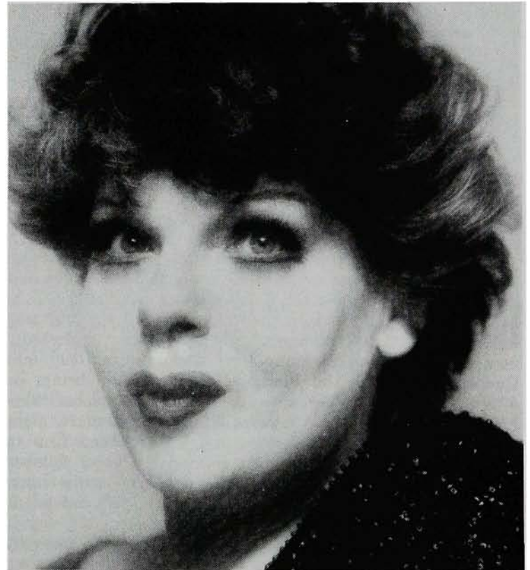
The idea of Craig Russell as Mae West or Judy Garland was Outrageous , even at Cannes!

Cannes '77 was a Canadian success story by now well recorded. Many of the elements of that story deserve careful analysis, not the least of which, of course, were our best international sales on record.