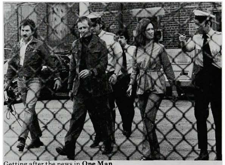
Getting after the news in One Man

So One Man works, the best Canadian film of this type yet made. In one sense, it marks the culmination point of the journalistic, reportorial films I wrote about a few months ago in Cinema Canada .