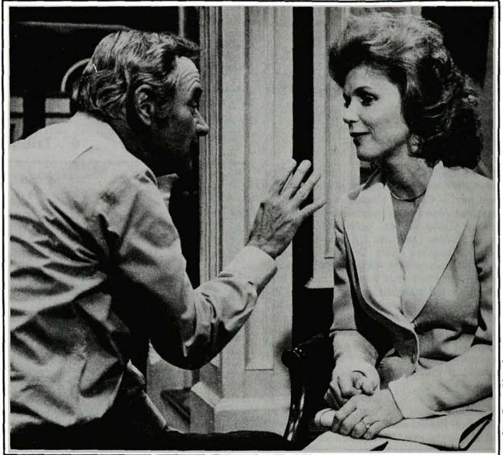
Jack Lemmon gives Lee Remick the soft-sell in a scene from Tribute