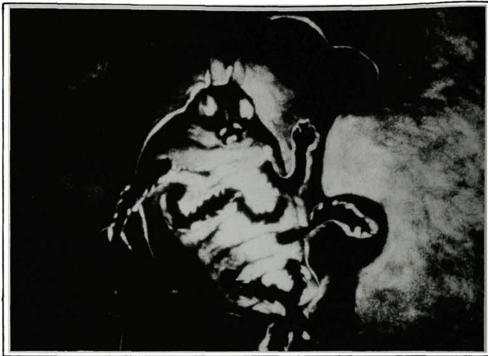
From the short film The Metamorphosis of Mr. Samsa (NFB)