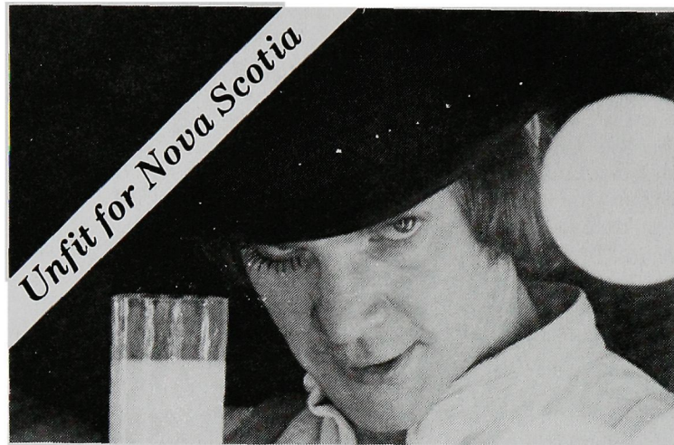
A Clockwork Orange by Stanley Kubrick