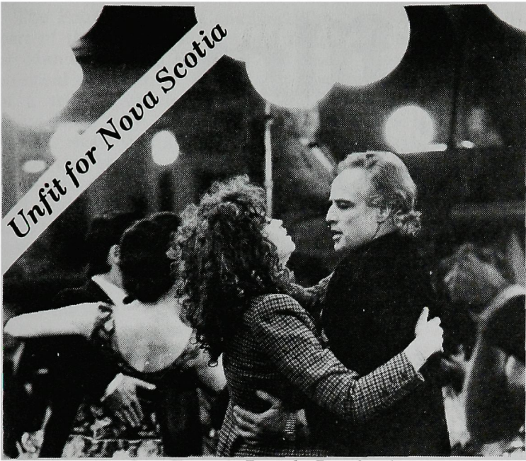
The tango in The Last Tango in Paris by Bertolucci

The appeal in the Supreme Court of Canada creates a federal-provincial conflict regarding jurisdiction and constitutionality. What the Supreme Court will actually do is difficult to predict. Here are three possible scenarios. At best we can hope for an abolition of censorship based solely on civil liberties and human rights. Second, the court may rule that censorship is under federal jurisdiction but make that claim in line with the Nova Scotia Appeal Court's reference to the Criminal Code. This careful ruling might cause Parliament to enact specific federal legislation over and above the current provisions in the Criminal Code against obscenity. The third choice would be a court decision to return censorship to provincial jurisdiction thus activating once again, at least in Nova Scotia, the archaic Board of Censors.